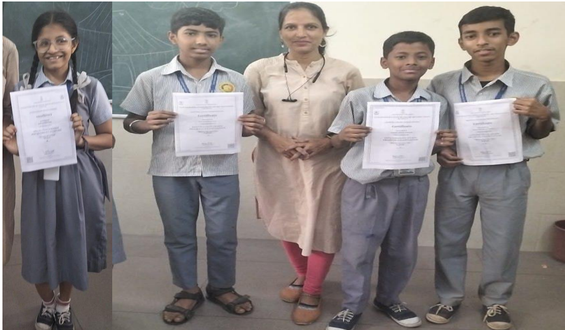
Students of grade 9 appeared for the Intermediate Art Examination

“How you draw is a reflection of how you feel about the world. You're not capturing it, you're interpreting it”. -Juliette Aristides