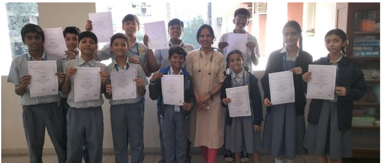
Students of grade 8 appeared for the Elementary Art Examination